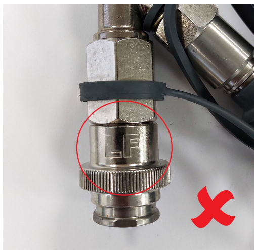
Fig 3. Incorrect Low Force (LF) outlet connector

If the Buddy Breather outlet connector (female) is engraved with AC on the collar, the Buddy Breather is correct therefore no further actions are required. See Fig 2. Correct Actuator (AC) outlet connector.