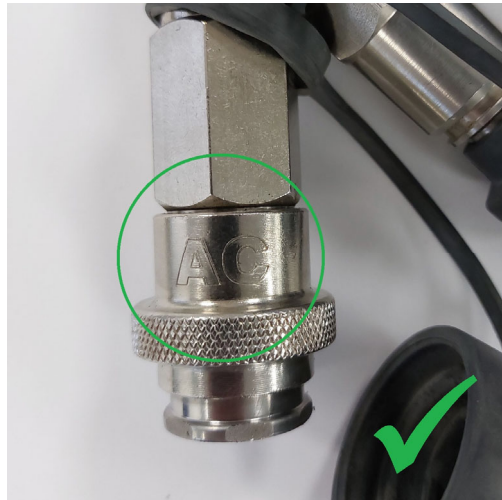
Fig 2 Correct Actuator (AC) outlet connector.

Draeger Safety UK Ltd requires that all Buddy Breathers supplied between September 2019 and October 2022 are visually inspected.