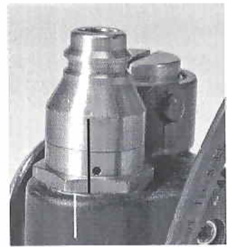
FIGURE 4 Loose at Manifold

If any loose couplings are discovered, please contact your local MSA authorized air mask maintenance center. Only MSA certified repair persons are authorized to remove or install a URC coupling.