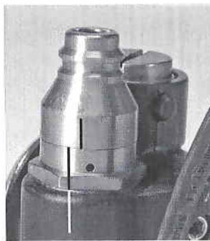
FIGURE 3 Loose at Coupling Joint