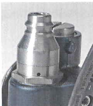
FIGURE 1 Typical Assembly

Note: Only authorized MSA or Aeroquip personnel should re-tighten the coupling.