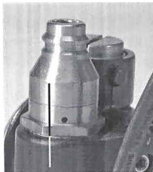
FIGURE 2 Tight