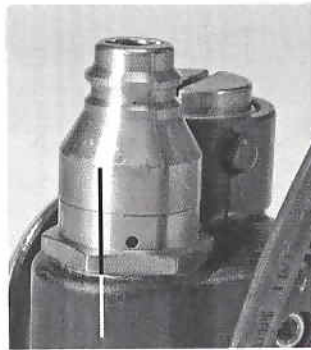
FIGURE 2 Tight