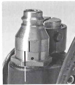
FIGURE 3 Loose at Coupling Joint