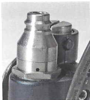
FIGURE 1 Typical Assembly

Note: Only authorized MSA or Aeroquip personnel should re-tighten the coupling.