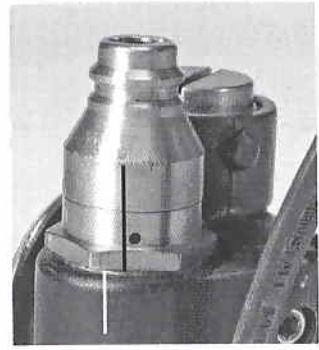
FIGURE 4 Loose at Manifold

To help ensure that the URC coupling remains sufficiently tight, it will also be checked by the MSA certified repair person during each scheduled air mask annual flow test. If you have any questions, please contact MSA Customer Service at 877-672-3473 or 412-967-3000.