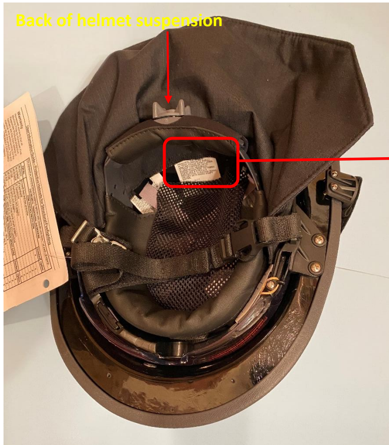
Position of product label on helmet shell interior

The photographs on the following page show an example of EV1 Traditional Helmet where the provided manufacturing date is “20230613” or June 13, 2013.