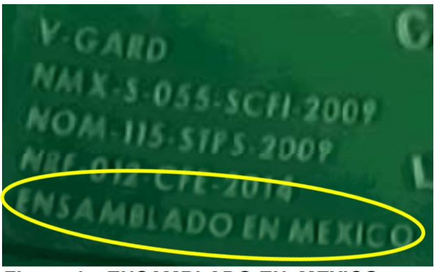
Figure 4 - ENSAMBLADO EN MEXICO