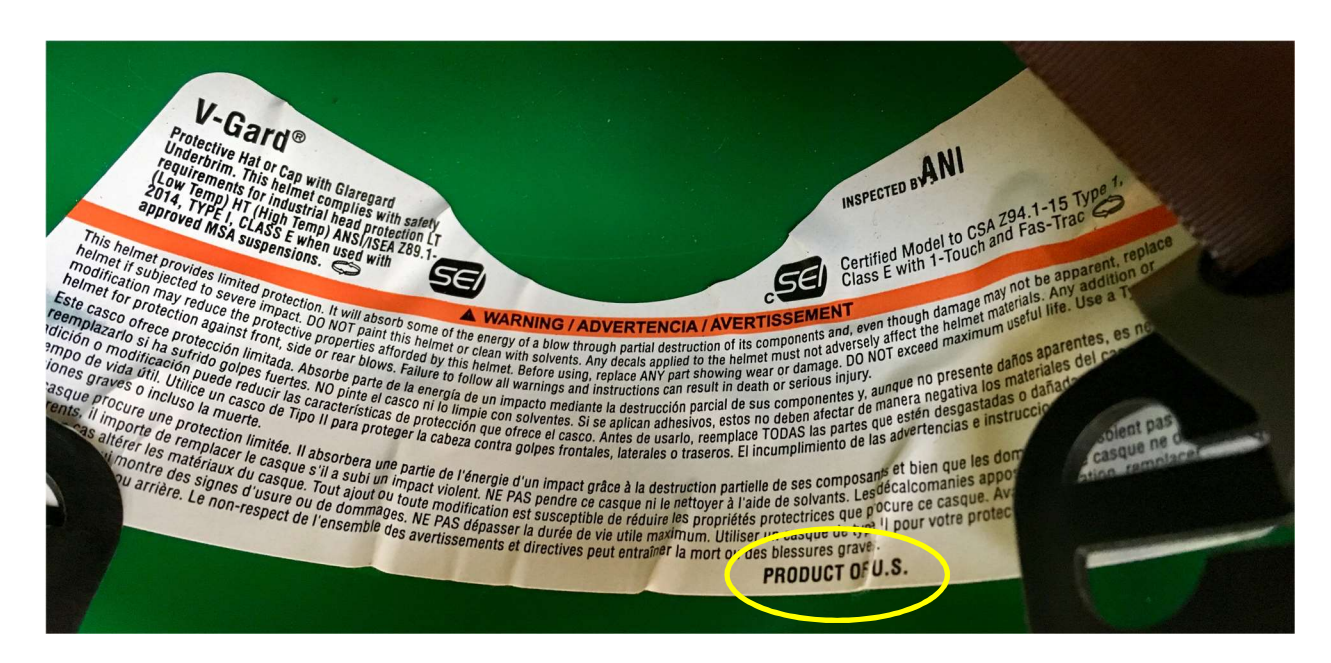
Figure 5 - V-Gard Label with PRODUCT OF U.S.

1000 Cranberry Woods Drive Cranberry Township, PA 16066 800.MSA.2222 www.MSAsafety.com